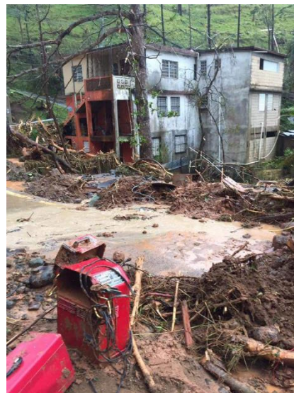
A Puerto Rico home, now sagging from the rath of Hurricane Maria.

As life has begun to return to the new normal of cleaning up, fixing up, and rebuilding, without the benefit of electricity and other necessities, new challenges are appearing daily in the neighborhood. For example, the need for rat poison has been added to the list of supplies we are sending as rodents have begun showing up in the devastated city.