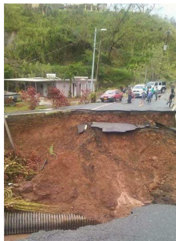
A sink hole emerges in the aftermath of Maria.