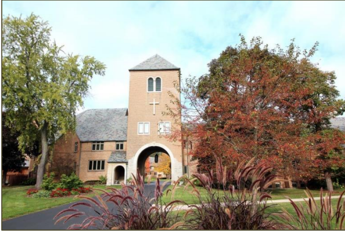
Wisconsin Lutheran Seminary Campus

“Dear class, let me tell you about the time when...”