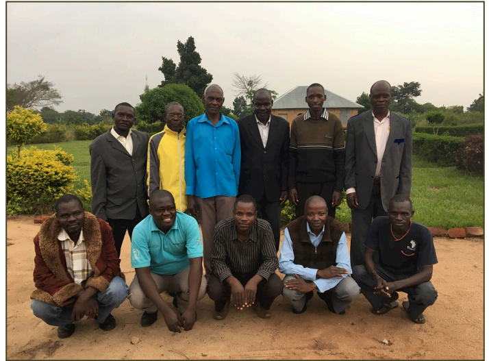
Pastors (back row) and Evangelists (front row) in New Hope Lutheran Church, Uganda