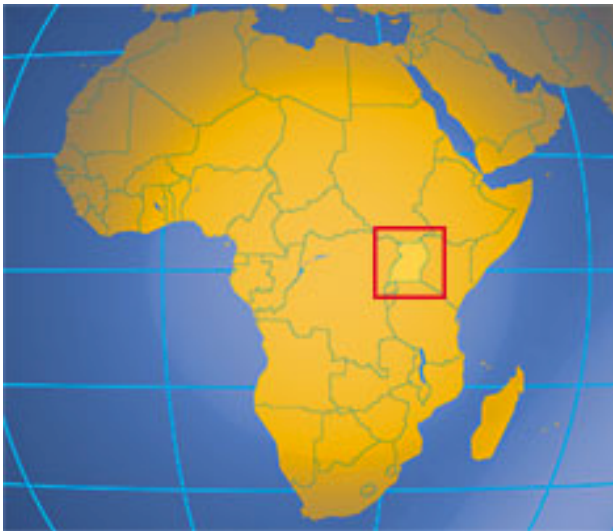
Uganda: The Pearl of Africa!