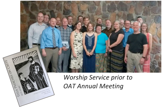
Worship Service prior to OAT Annual Meeting