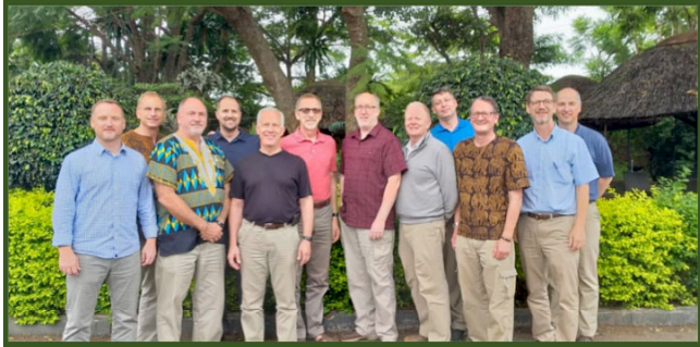
OAT with BWM, ACA and PSI Leaders

“Through theological education and coordination of WELS resources, we, the One Africa Team, assist our partners in Africa to grow as independent, healthy church bodies.”