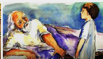
The Call of Samuel