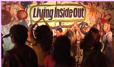
You, You, You