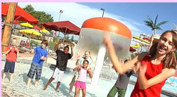
He's Got the Whole World