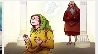
The Story of Samuel

Watch these videos about Samuel, then answer the questions.