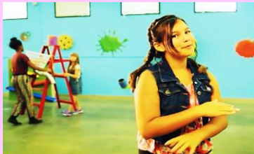
Living Inside Out