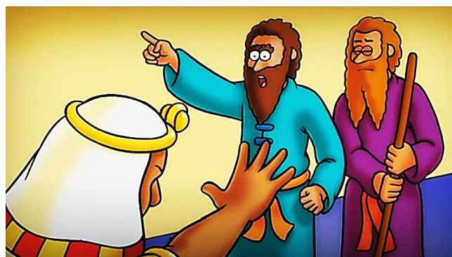
The 10 Plagues #1