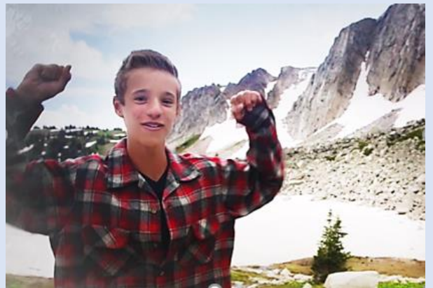
My God Is Powerful