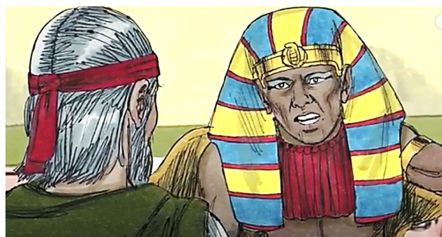
The 10 Plagues #2