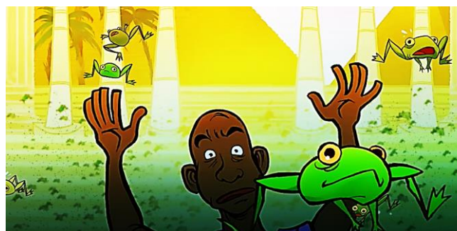
The 10 Plagues #3