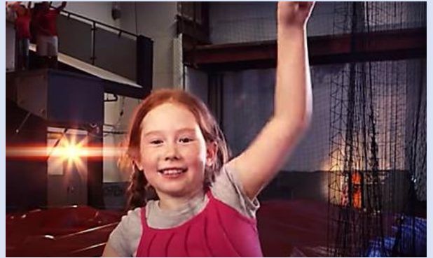
My God Is So Great