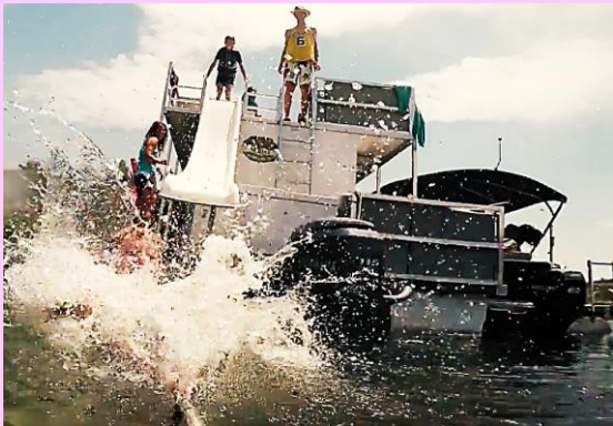
God Has Given Me