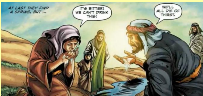
Exodus 15: Marah