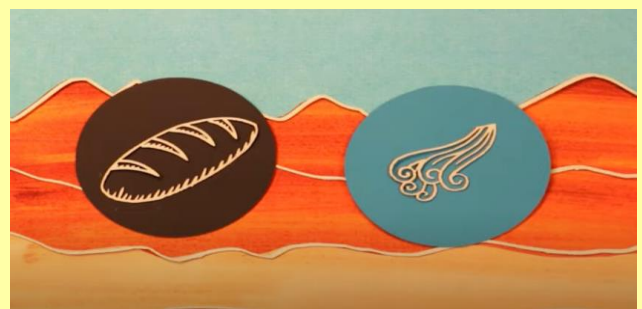
God's Story: Wilderness