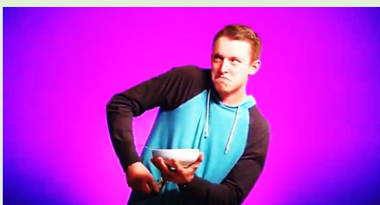
Water, Manna, and Quail Message