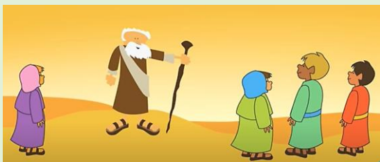
God Sends Manna