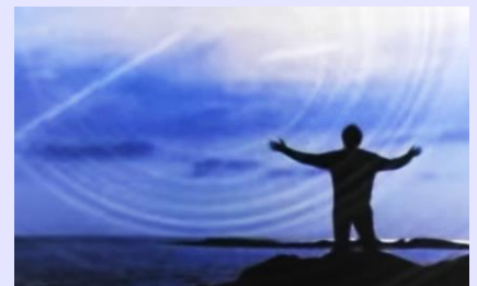
His Love Endures Forever