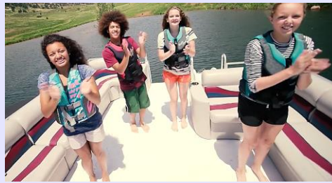
God Has Given to Me