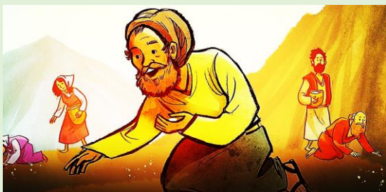
40 Years in the Wilderness