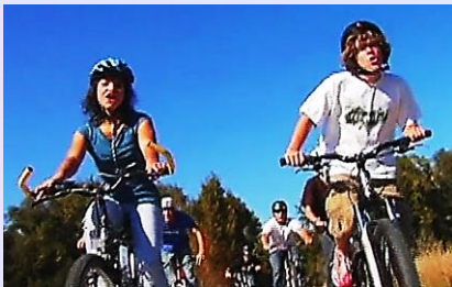
I Will Never Fail You