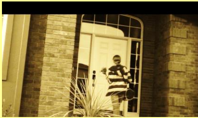
My Help Comes from the Lord