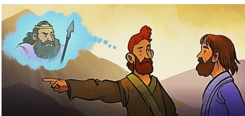
Jonathan Warns David